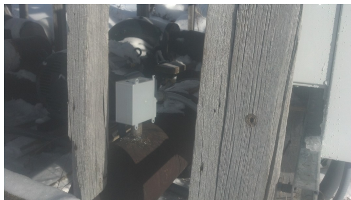
Variable frequency drive and transducer installed as part of the Agricultural Efficiency Program